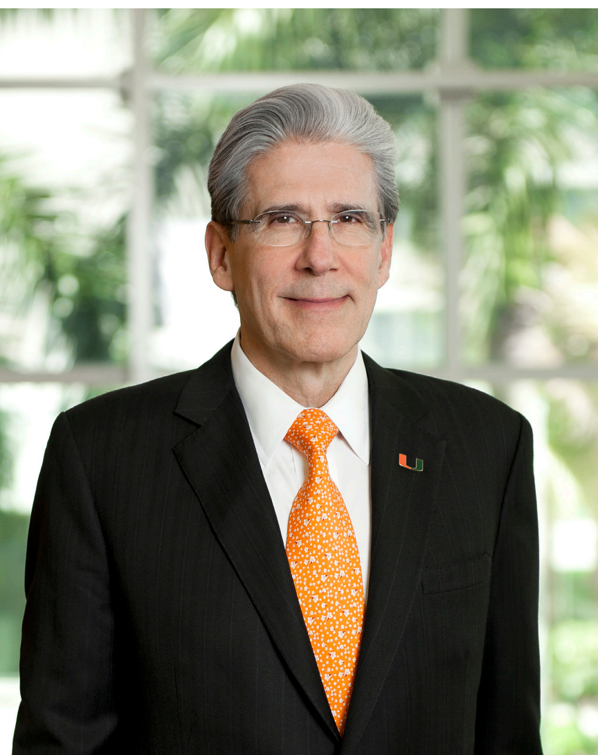
Dr. Julio Frenk